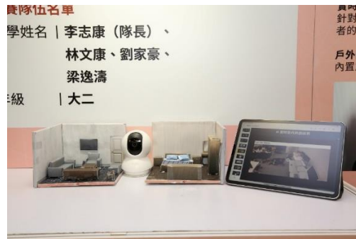
Bronze Award (Tertiary Student Category) – Top Safety