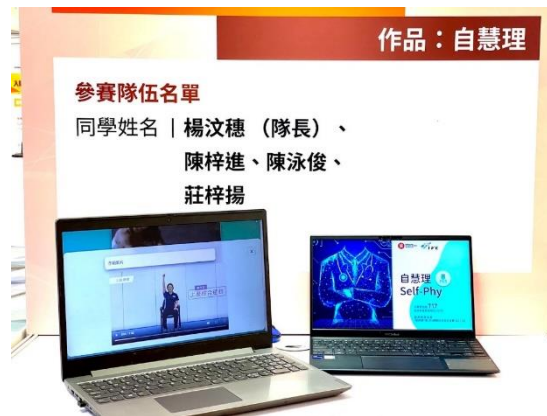
Gold Award (Tertiary Student Category) – SmartPhy-Treatment (SPT)