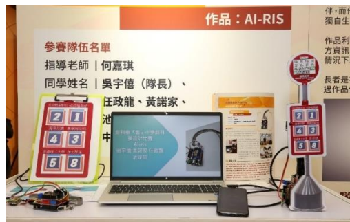
Gold Award (Secondary School Student Category) – AR-RIS