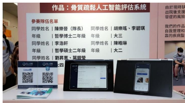
Silver Award (Tertiary Student Category) – The AI-based Osteoporosis Prognostic System