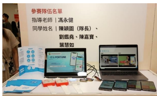
Bronze Award (Secondary School Student Category) – Helping Hand